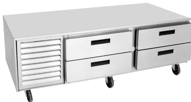
(Model 20064RSB with optional casters)

20032RSB (32" wide); 20036RSB (36" wide); 20048RSB (48" wide); 20060RSB (60" wide); 20064RSB (64" wide); 20072RSB (72" wide); 20084RSB (84" wide); 20096RSB (96" wide); 20108RSB (108" wide)