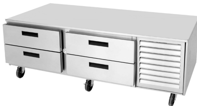
(Model 20064SB with optional casters)

20032SB (32" wide); 20036SB (36" wide); 20048SB (48" wide); 20060SB (60" wide); 20064SB (64" wide); 20072SB (72" wide); 20084SB (84" wide); 20096SB (96" wide); 20108SB (108" wide); 20120SB (120" wide)